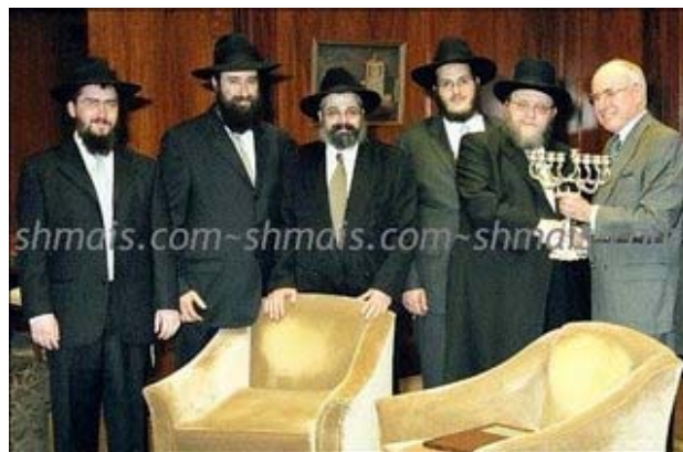
Australia - Prime Minister John W. Howard

Are YOU ready for the Isreali occupation template to be superimposed over your neighbourhood?